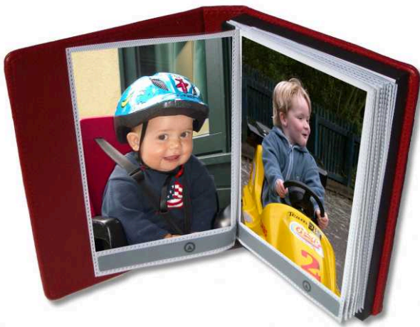
Talking Photo Albums are available in either black or burgundy.

The photos are displayed in 'flip' style and the voice messages are re-recordable. Each individual voice message can be played back at any time, simply with a push of a button. The digital Flash Memory will preserve your recordings forever, (even when you change the batteries!).