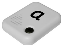
Sound Buttons with built-in magnets!